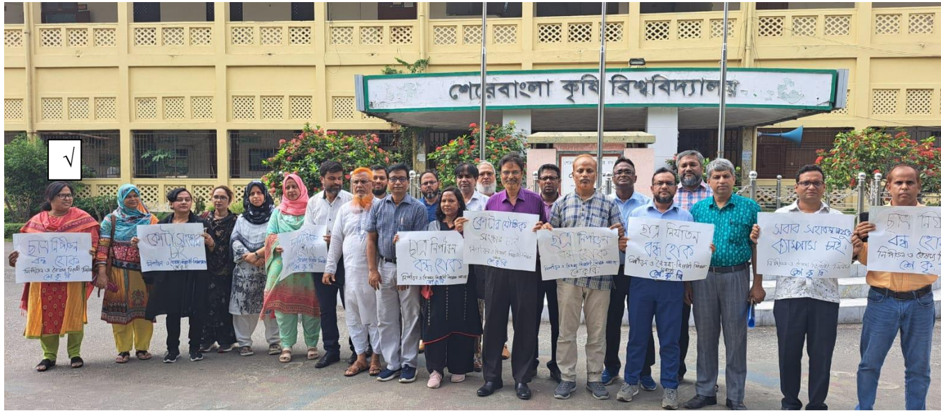
Photo 1b. Procession of 'নিপীড়ন বিরোধী শিক্ষক সমাজ' of Sher-e-Bangla Agricultural University against the killing of the students of 'বৈষম্যবিরোধী ছাত্র আন্দোলন' (18 th July 2024)