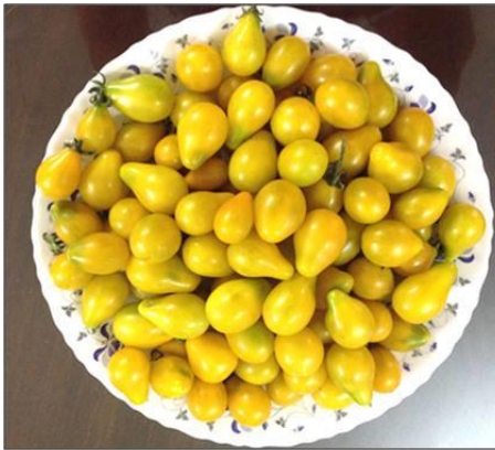
SAU tomato 1