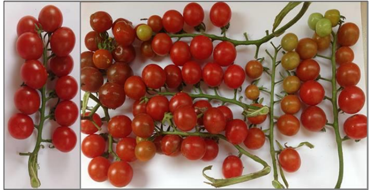
SAU tomato 2