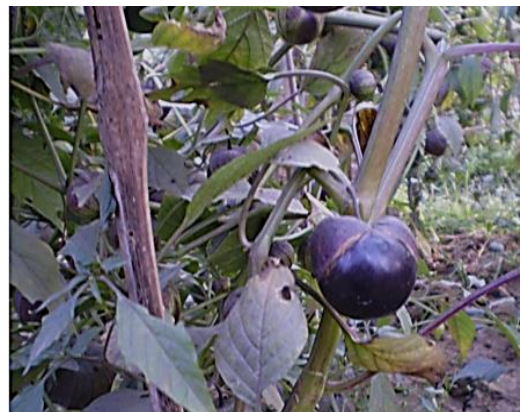
SAU tomatillo 2