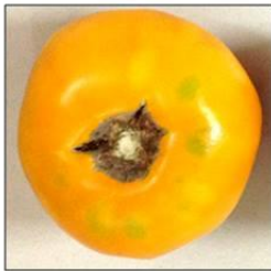
SAU tomato 3