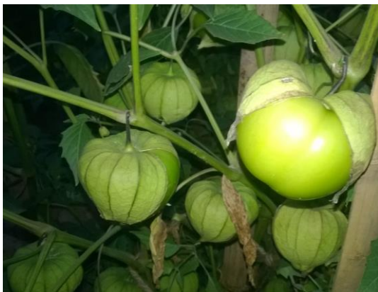
SAU tomatillo 1