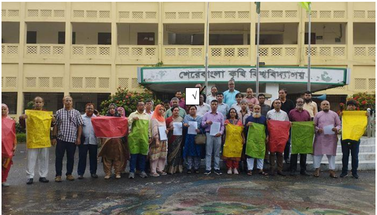
Photo 2. Procession of 'নিপীড়ন বিরোধী শিক্ষক সমাজ' of Sher-e-Bangla Agricultural University against the killing of the students of 'বৈষম্যবিরোধী ছাত্র আন্দোলন' (2 nd August 2024)