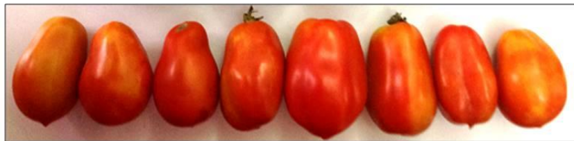
SAU tomato 4